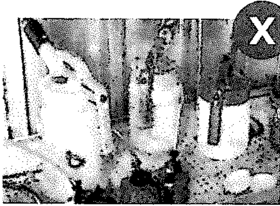
Unlabelled oil containers - these could easily lead to the wrong oil being used