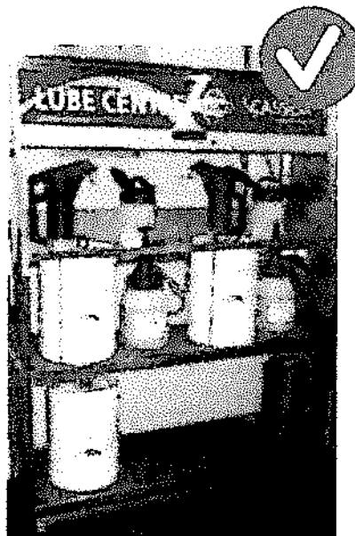
Compliant storage with built-in bund and oil-transfer containers clearly labelled in a clean, designated area